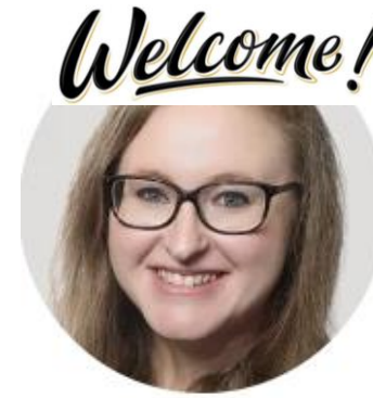
Kim Tenure Developmental Pathways